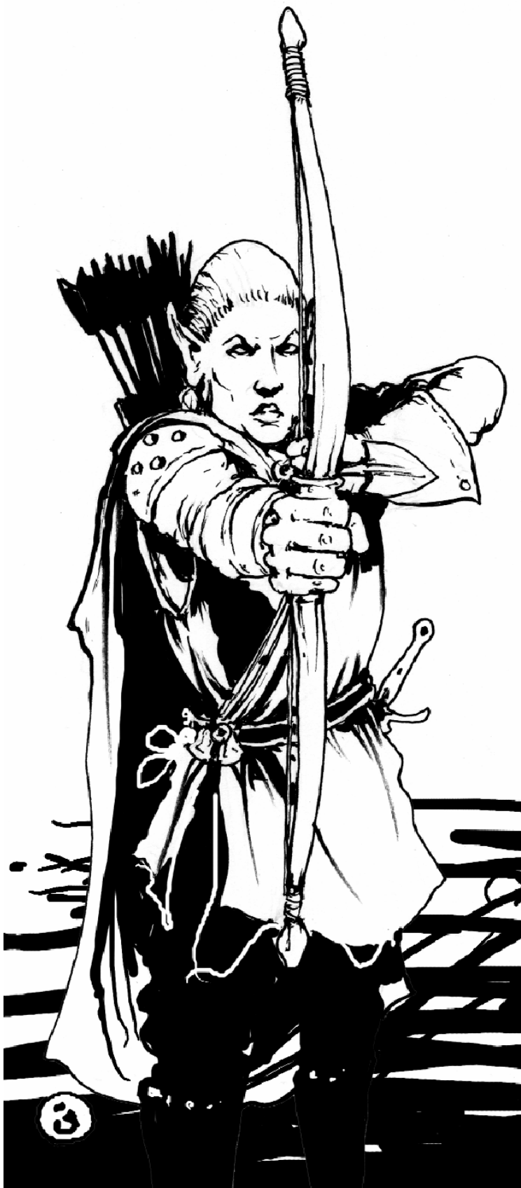
Table 3 The Outlander

Alertness, Dodge (Mobility, Spring Attack), Endurance, Expertise (Improved Disarm, Improved Trip, Whirlwind Attack), Great Fortitude, Iron Will, Lightning Reflexes, Mounted Combat (Mounted Archery),