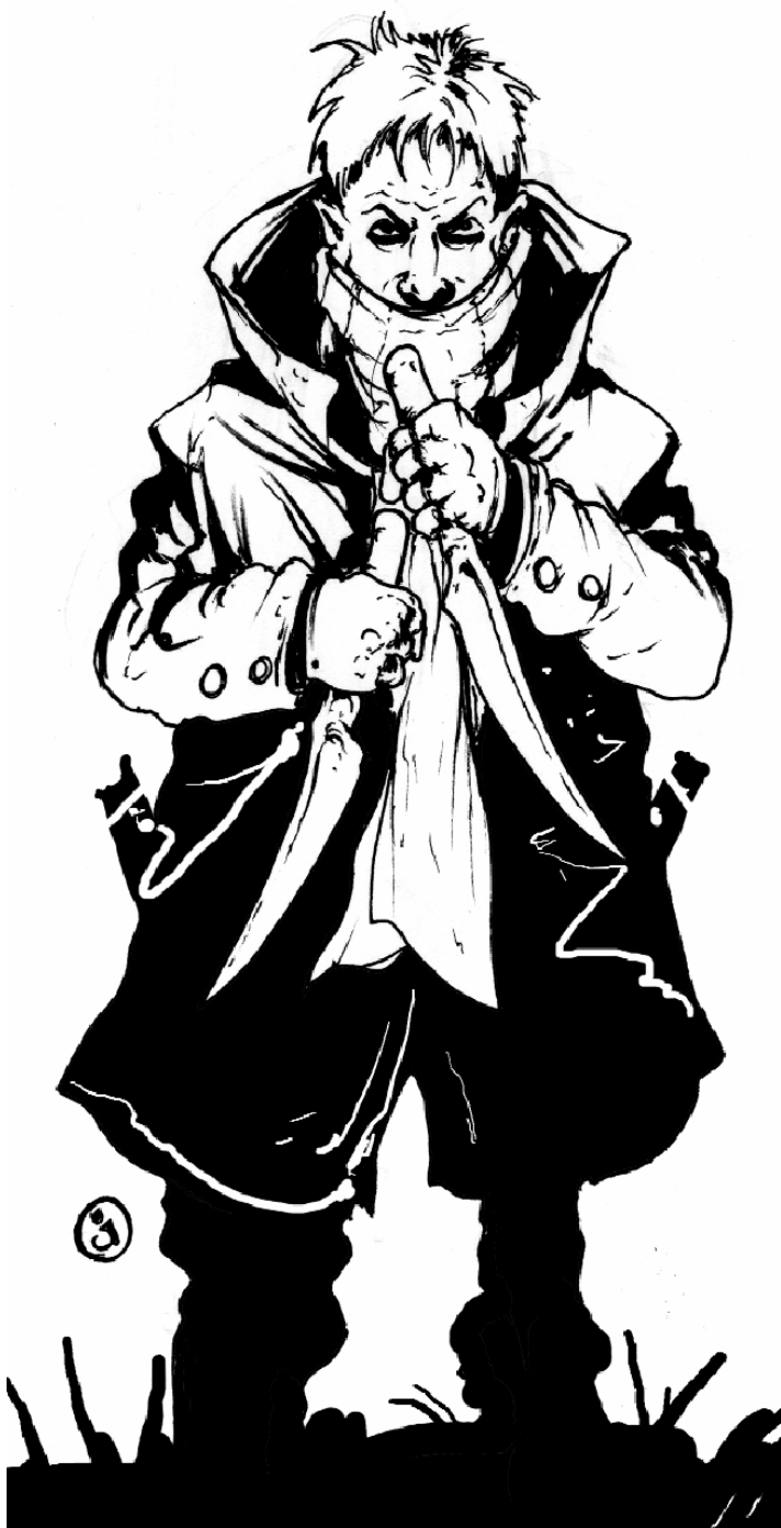
Table 2 The Thief

Defence bonus: As the Thief progresses they learn to best position themselves to avoid being hit by their enemies' attacks. As such their AC increases as they progress levels by the defensive bonus listed in table 2. At first level the Thief gains a +1 to their AC, at second level this is increased to +2, and at fourth level this is improved again to