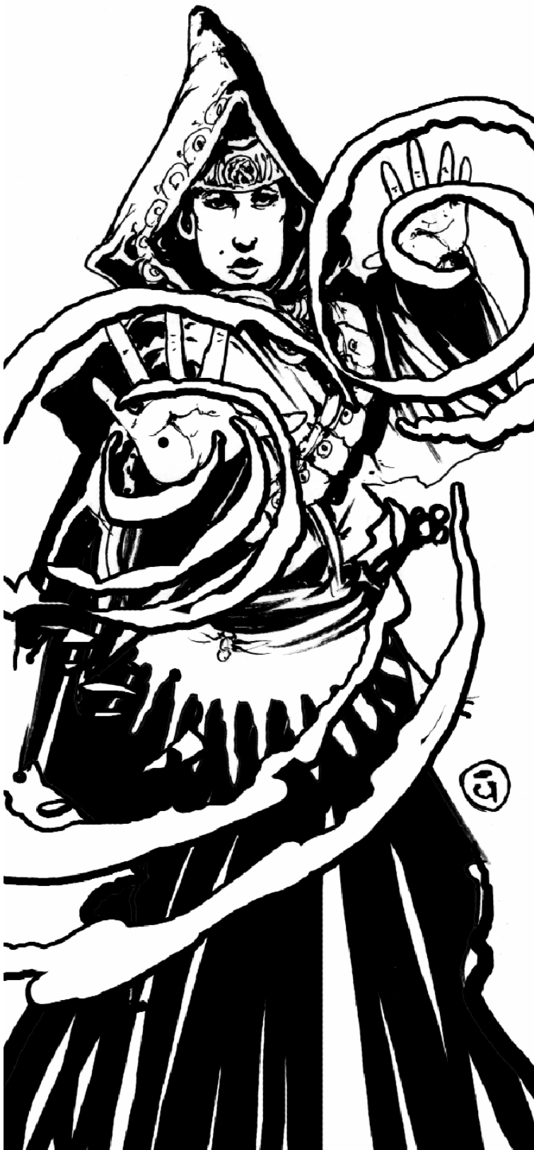
Table 4 The Scholar

Defence bonus: As the Scholar progresses they slowly learn to best position themselves to avoid being hit by their enemies' attacks. As such their AC increases as they progress levels by the defensive bonus listed in table 4. At fourth level the Scholar gains a +1 to their AC, at seventh level this is increased to +2, and at tenth level this is improved again to +3.