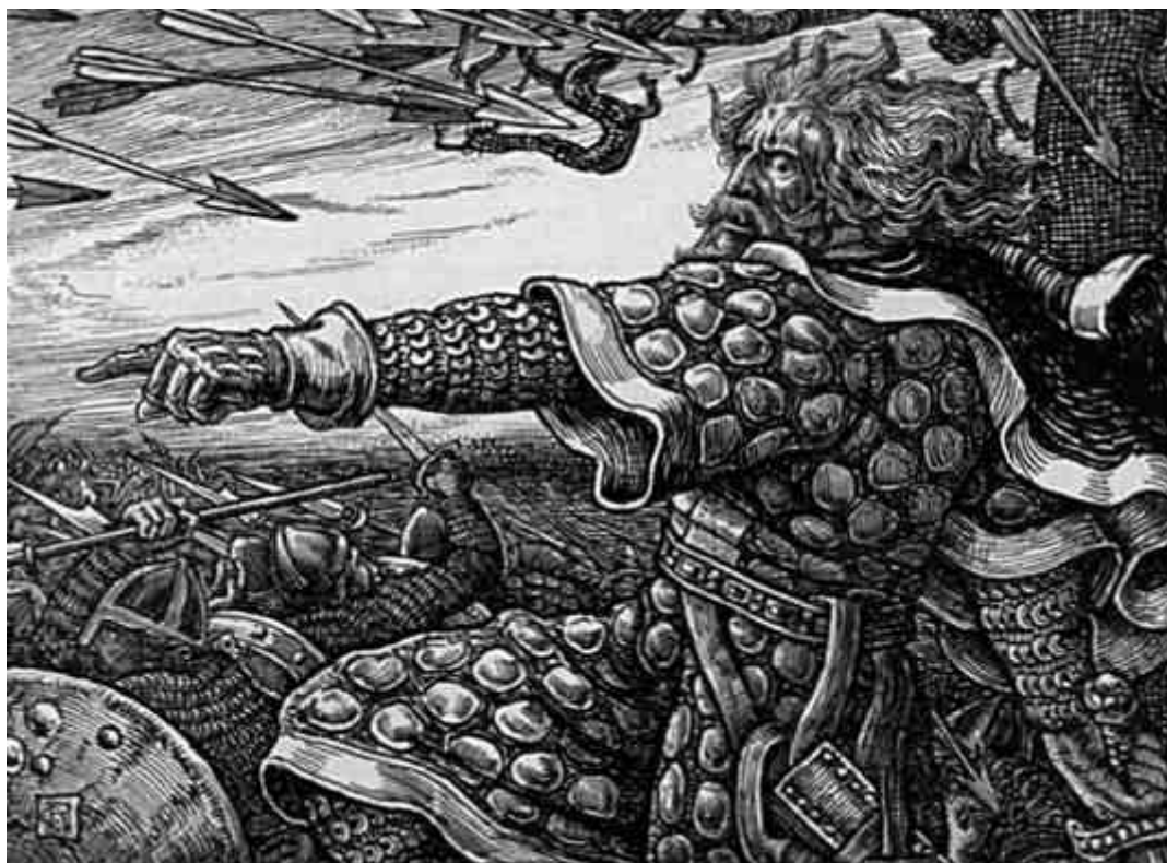
This image is public domain and can be used freely.

The following page will show you what we have done to create derivative works from these public domain images.