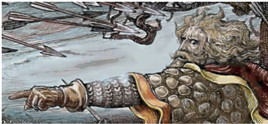
This is a derivative work and thus not public domain.

This is a derivative piece of art since one of our artists used his own artistic flare when coloring the image. This allows a public domain image to become once again copyrightable