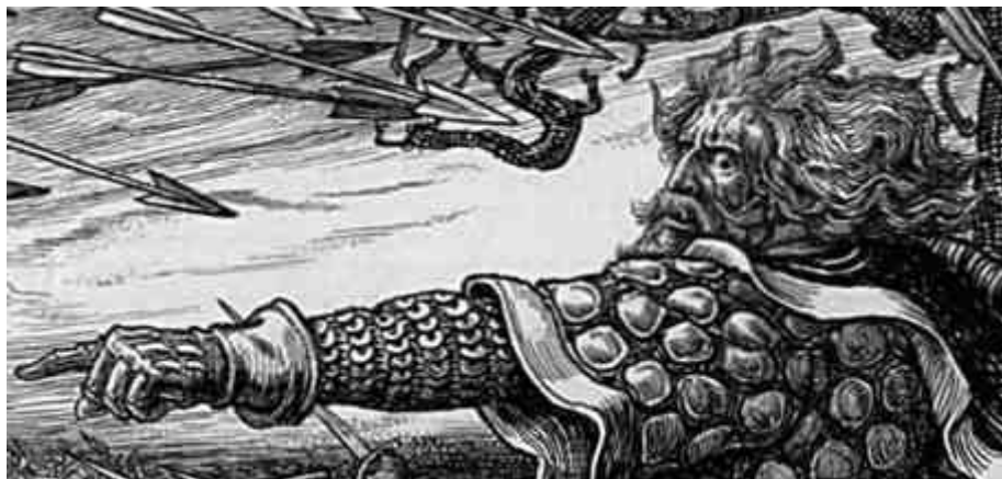
This image is public domain and can be used freely.

The image to the right is still a public domain image. Cropping or altering the size of a public domain image does not constitute enough of a change to become a derivative.